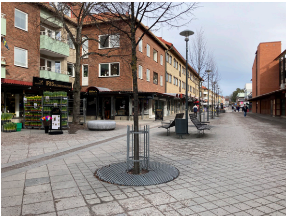
Sandviken city centre

The residency program in Sandviken represents a chance to investigate artistic organisation in peripheral areas, collective strategies for culture production, independent and DIY culture, industrial history and its effects on global and local economy.