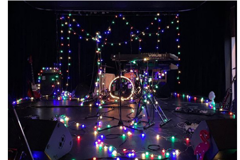
The gallery space and stage at Backbeatbolaget